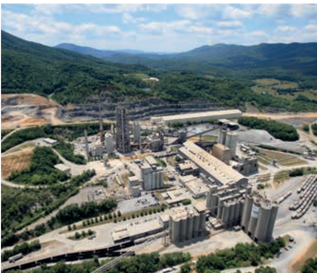
Roanoke cement plant, USA

We acknowledge that through supply chain sustainability we can deliver long-term environmental, social and economic value for all stakeholders involved in the value chain. In 2017, we continued the Group Procurement Transformation program that was launched in 2016. The program aims to optimize the number of TITAN suppliers, build longer-term and more value-adding relationships, focusing on the “total cost of ownership” concept and driving greater focus on sustainability. We selected one of the world’s leading providers of supply chain risk management solutions to pilot and test a standardized approach to supplier prequalification, including sustainability criteria, in our operations in the United States, in preparation for further rollouts in 2018.