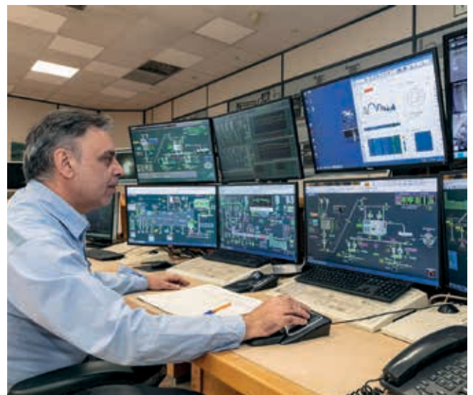
Kamari cement plant, Greece