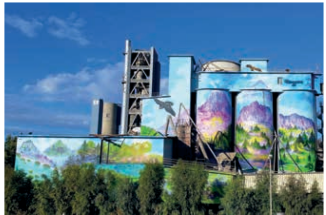
Thessaloniki cement plant, Greece

Environmental All cement plants and most of the installations related to our other activities are certified under ISO 14001